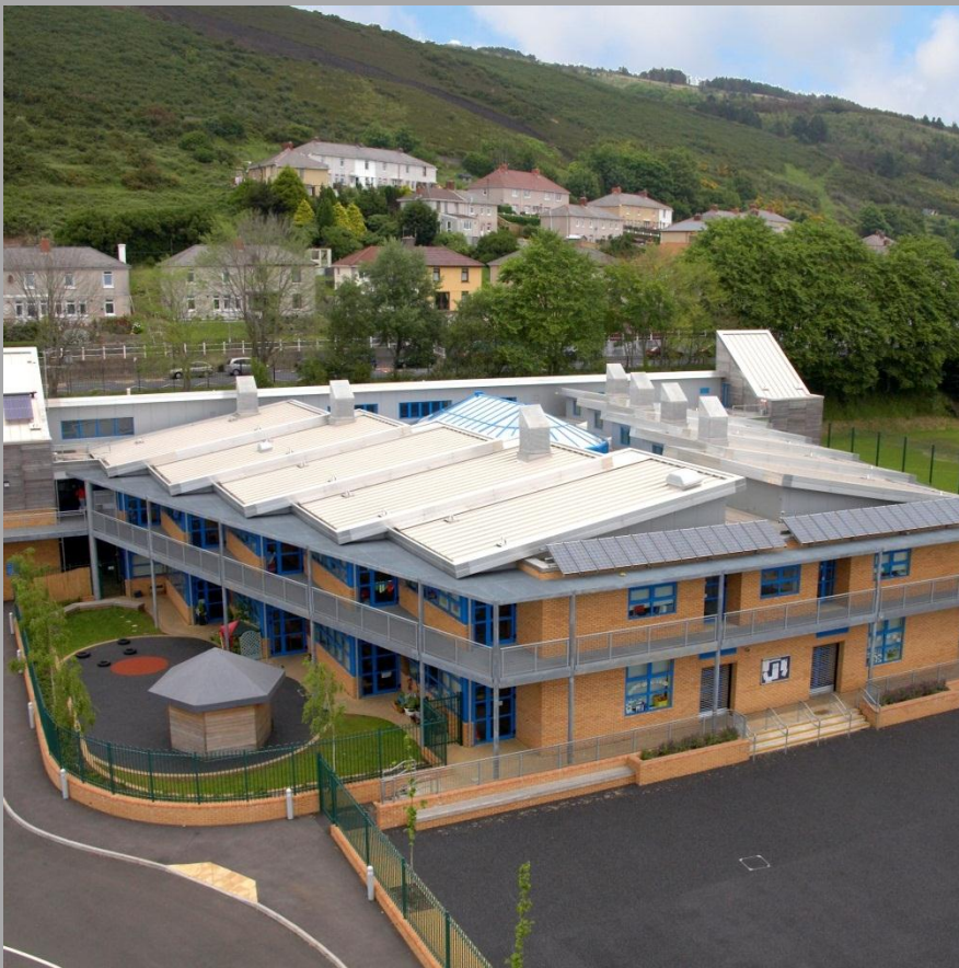
KingZip IP Standing Seam Insulated Panel KS500/1000 ZIP IP